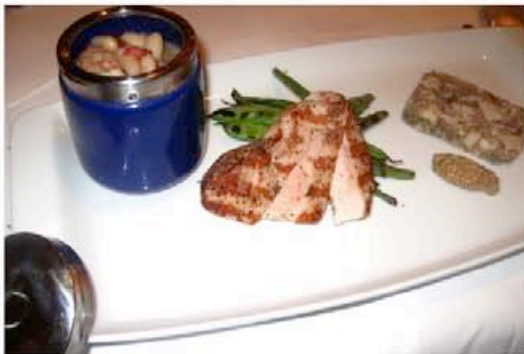
Hiramasa crudo with fried jalapenos and cubed watermelon