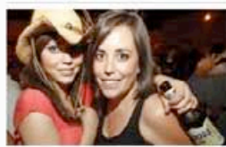
Flip Cup Tournament at Front Porch