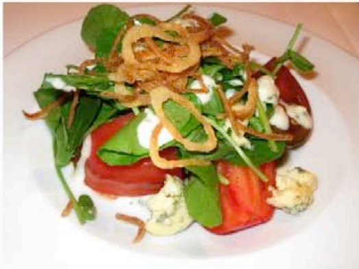
Headcheese with housemade mustard, sliced Duroc pork and pork and beans