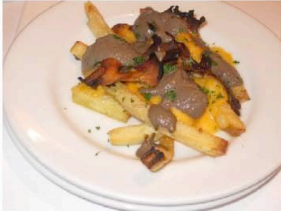
Poutine with roasted hen of the woods mushrooms, vegetarian porcini gravy and cheddar cheese curds