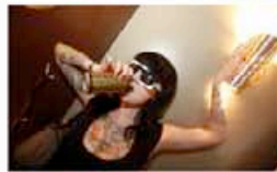
Fourth of July Bar Hopping